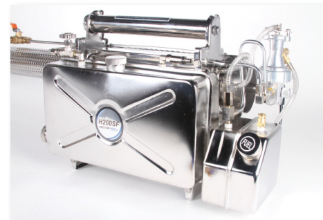
Simple operation and low cost make the VectorFog H200SF attractive for both commercial and residential applications.

If you have any questions or need more information, please contact Nixalite® of America Inc. We are at your service.